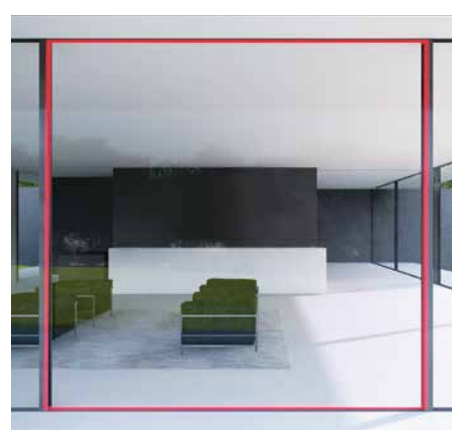
Seal active – 100% sealed